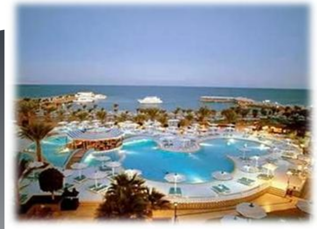
Sharm El Sheikh